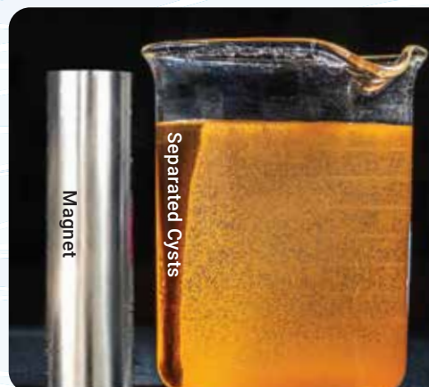
SEP-Art magnetically draws cysts away from nauplii

Your ultimate combination in nauplii separation and Vibrio protection